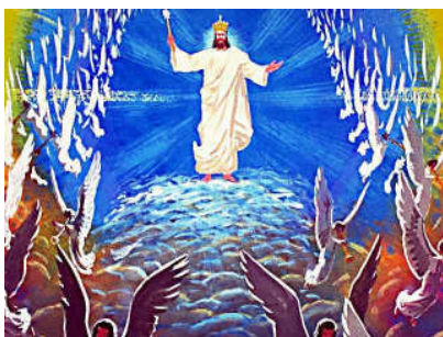
At the Second Coming of Jesus – Death will be conquered.

Some are concerned for those who have died in some terrible way, and the body has been mangled or eaten by wild animals, or some other tragic thing has happened. There is no need to be concerned. God promises in 1 Corinthians 15 to give us a new incorruptible body. We will not possess the same atoms of flesh we now have. In the meantime, God preserves our individual personality and character, then just as He created Adam, so He will re-create us – perfect – to live forever.