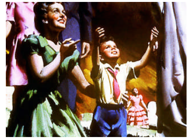
The resurrection of the righteous.

The sleep of death does not last forever; instead it will be broken by the voice of Jesus as He calls the dead to life on the day of resurrection. It can be clearly seen why the dead do not go to heaven or hell at death. If this were the case, there would be no need of the resurrection day to receive the rewards, for one would have them already.