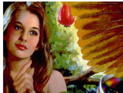
Adam & Eve were tempted to believe that they were immortal.

The devil would have Adam and Eve believe they were immortal (not subject to death) but here it is clearly taught that our bodies are mortal (subject to death). Many today believe humans are naturally immortal, even the worst of sinners, and that some part of us will never die. Millions have been deceived by the devil's assurance: "You will not surely die".