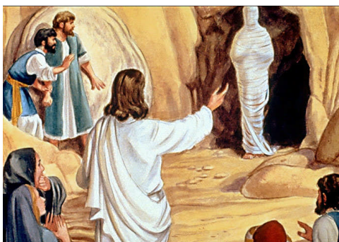
Jesus raises Lazarus from the sleep of death.

John 11:11-14 These things He said, and after that He said to them, “OUR FRIEND LAZARUS SLEEPS, but I go that I may wake him up.” Then His disciples said, “Lord, if he sleeps he will get well.” However, Jesus spoke of his death, but they thought that He was speaking about taking rest in sleep. THEN JESUS SAID TO THEM PLAINLY, “LAZARUS IS DEAD”.